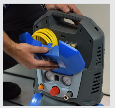
Smart flap for your tools storage. Be always ready.