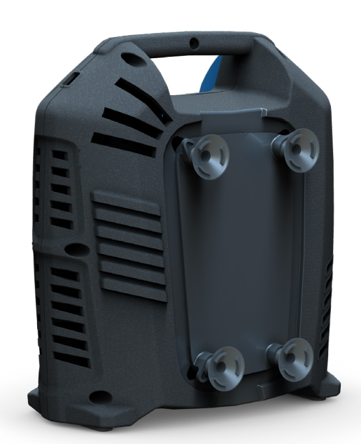
SUITCASE 0 1.5 HP

Extra small sizes are not reflecting the performances of ABAC Suitcase which offers on the contrary important air displacement of 160 l/m, 8 bar pressure and relies on 1,5 HP engine power.