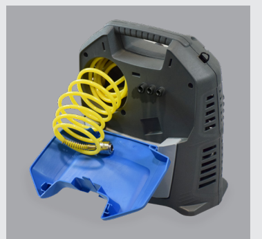
Spiral hose with universal tools mount.