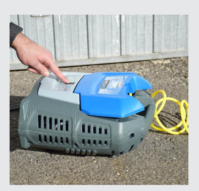
Designed to work efficiently both in vertical and horizontal position.