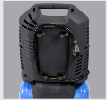
Extra shock absorber feet for horizontal use.

Ease of use and compactness are the most notable attributes behind new ABAC Suitcase air compressor.